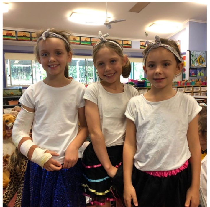
Year 1/2 dramatic, athletic , studying hard and just chilling out!