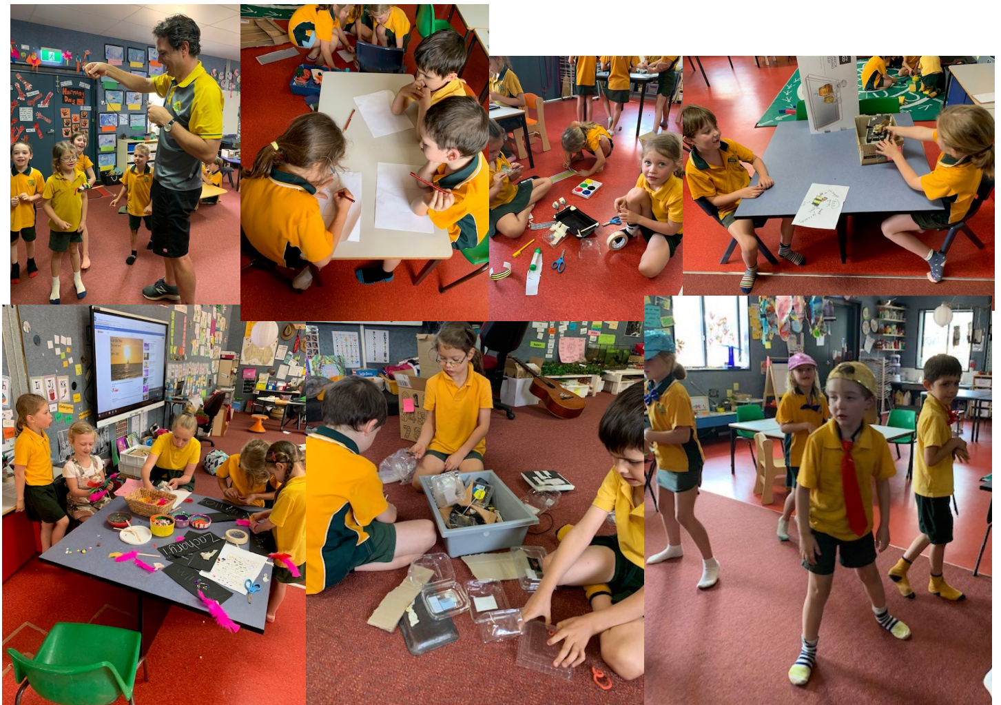
Friendship and Learning at Dunoon in the K/1 Classroom