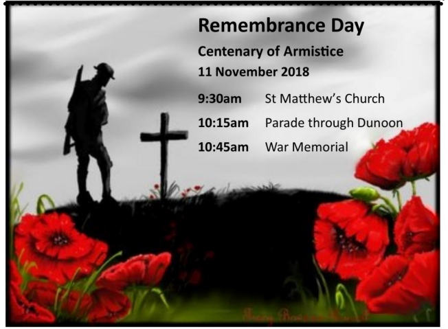
Image from Longbeach RSL: https://www.longbeachrsl.com.au/remembrance-day-service-20