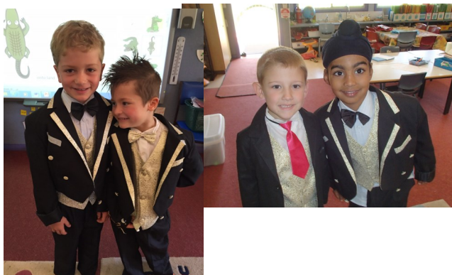
A sneak preview of some K/1 dancers