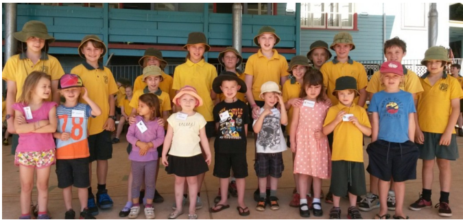
Above KINDER 2015 AND THEIR BUDDIES FROM LAST WEEK